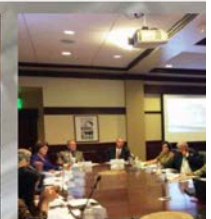
Interim & Committees