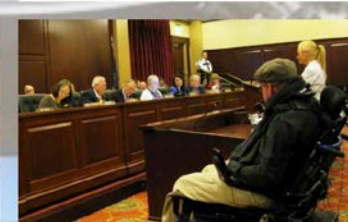
Testifying Before Legislative Committees